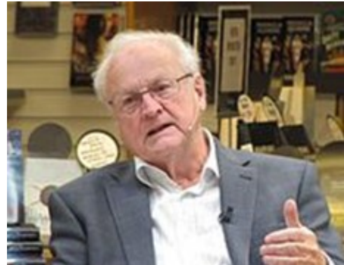
Dr Arvid Carlsson talks about the absurdity of water fluoridation

In a 2005 interview, Dr. Arvid Carlsson noted that “fluoridation is against all modern principles of pharmacology. It’s obsolete. I don’t think anybody in Sweden, not a single dentist, would bring up this question anymore.”